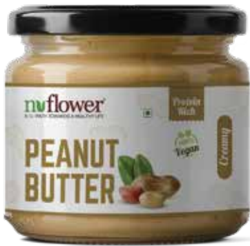
Peanut Butter Crunchy & Creamy